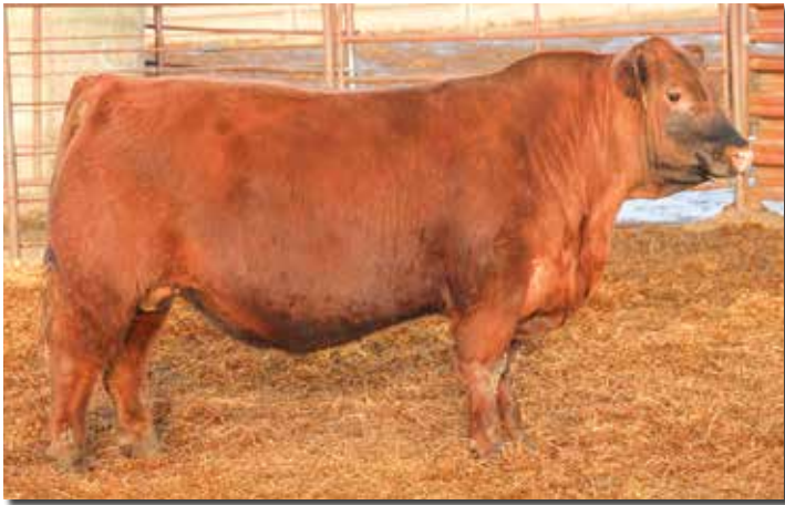
Lot 45 • MLK CRK FIVE STAR 5251

Lot 44 registered the 2nd largest ribeye in this record book, along with a 108 and 105 weaning and yearling ratio. His dam is a 9-year-old Advocate 4304 daughter with a 104 MPPA and is easy to look at.