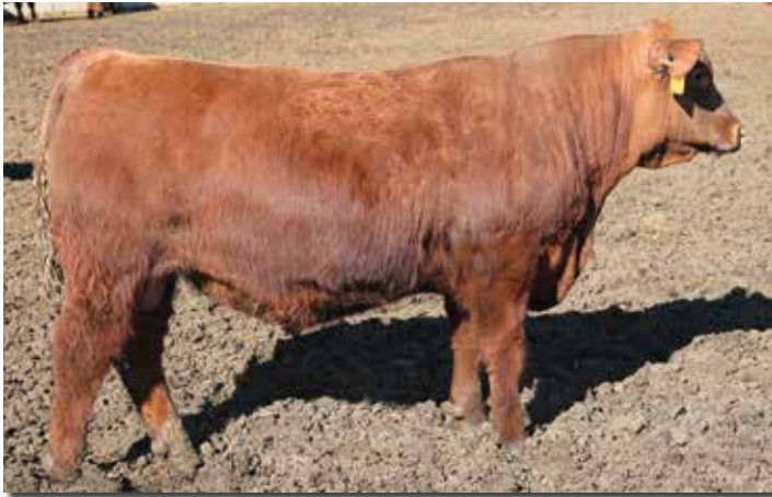
Lot 33 • MLK CRK MCCANN 5346