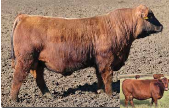
Lot 106 • MLK CRK FUSION TOO 5202