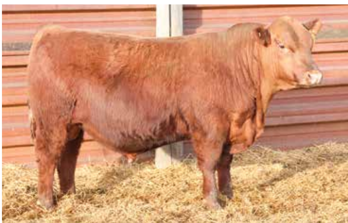
Lot 3 • MLK CRK LIFE IS GOOD 5249

Lot 2's dam has been very consistent in her production bringing in top calves every year earning her a 106 MPPA. This year's bull is a standout Fusion 5202 son that not only ratios well in growth and carcass but also has a herd bull look. His length, depth, and thickness when added to a respectable EPD and Index profile positions him to fit well in the top pen of bulls.