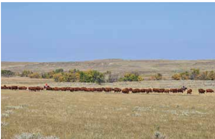
Headed back to pasture after ultrasounding.

Combining strong cow families on all sides of the pedigree can build confidence that the progeny produced will have above average performance and great maternal traits. Lot 34 started life at 78 pounds but continued a growth spurt that earned him a 106 weaning and 105 yearling ratio. He is also above average in marbling and ribeye.