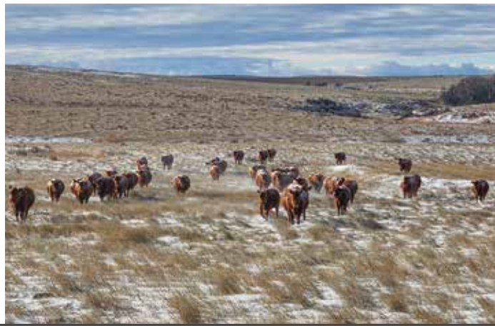
Coming out of the creek on a chilly morning.

We are now 3/4 through the bulls and still have a Foreman son that has calving ease with above average growth and a solid cow family generations deep behind him.