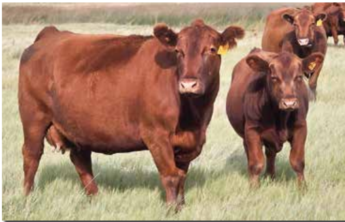
Dam to Lot 50 • MLK CRK LAKOTA 669

Rooted in the maternal strength Milk Creek Reds is known for, Sumo is designed to leave productive, long-lasting daughters with functional efficiency. His balanced carcass profile supports end-product value without sacrificing real-world performance.