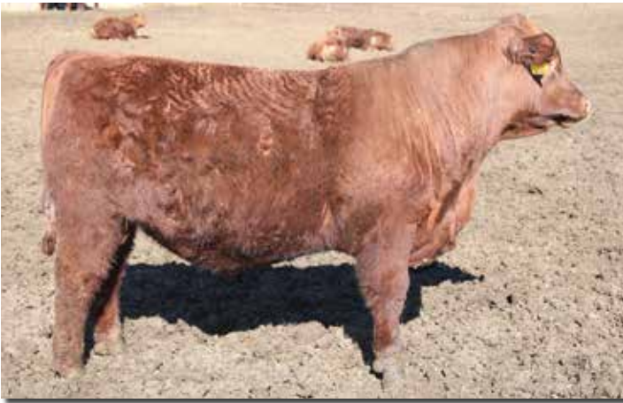
Lot 75 • MLK CRK AGENT 5312