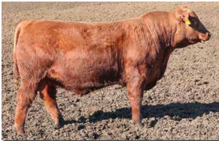
Lot 70 • MLK CRK SPOKESMAN 5218

Lot 69 will work in many different breeding scenarios. He offers calving ease with average and above growth, while ranking at the top of the breed for Herdbuilder and ProS indices.