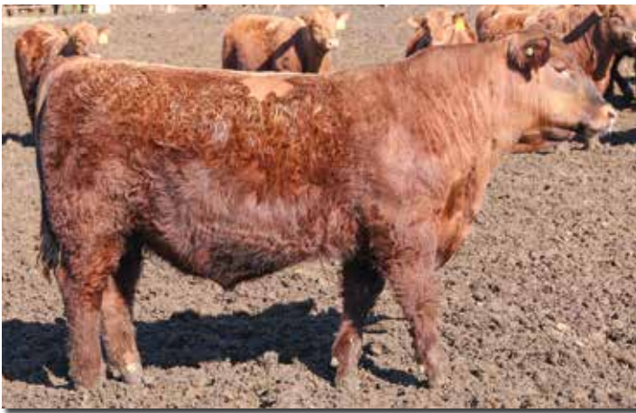
Lot 5 • MLK CRK FOREMAN 5247

5243 is a long made, stout, Life is Good son that earned his way to the top pen posting above average ratios for growth while maintaining an acceptable birth weight.