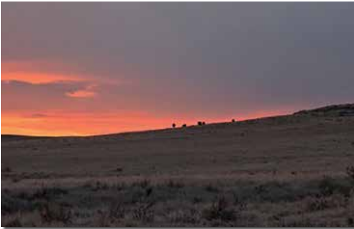
Coming around the hill.