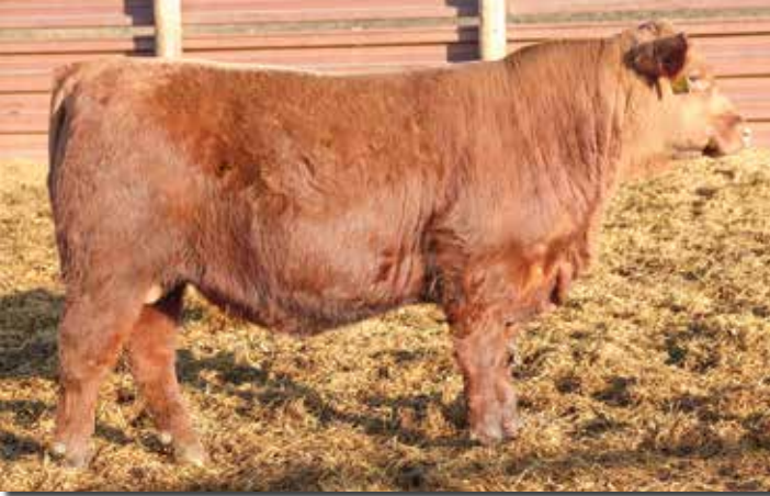
Lot 80 • MLK CRK JELLY BELLY 5206