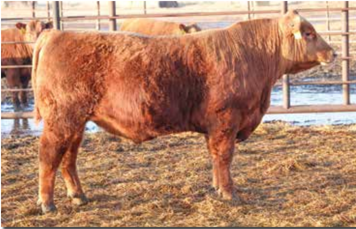
Lot 4 • MLK CRK LIFE IS GOOD 5243