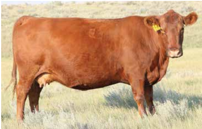
Dam to Lot 100 • MLK CRK SHEBA 947