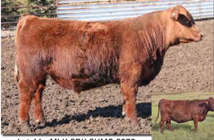
Lot 44 • MLK CRK SUMO 5378