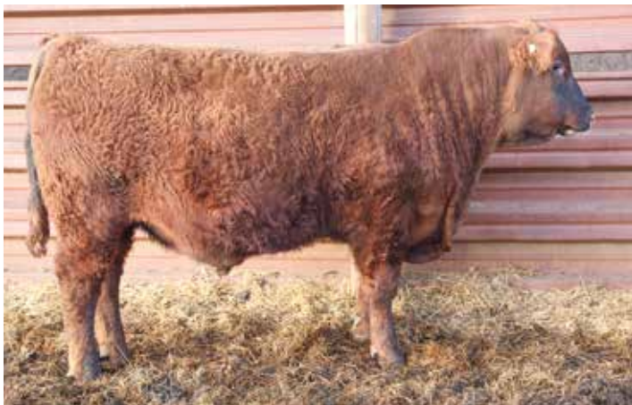
Lot 79 • MLK CRK JELLY BELLY 5226

Lot 78 hits a lot of the bases across both individual performance as well as EPDs and Indices. Ranking and measuring well in Weaning, Yearling, Marbling and Ribeye will help to take a look at him in the pen and then not be disappointed with what you see.