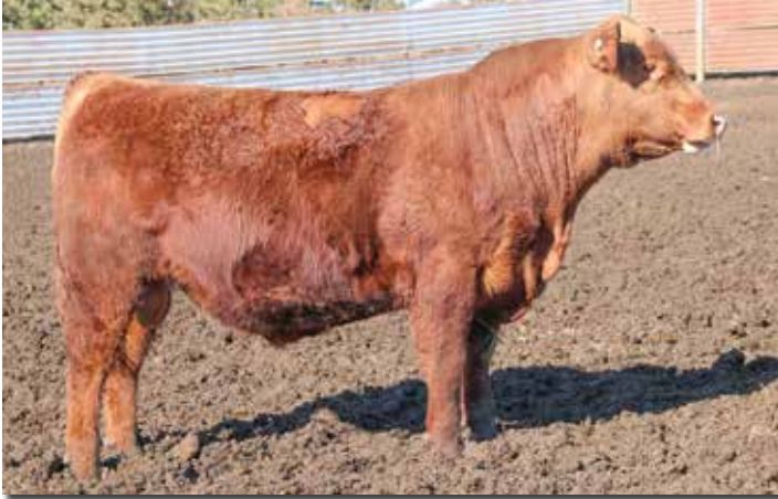
Lot 56 • MLK CRK LIFE IS GOOD 5253