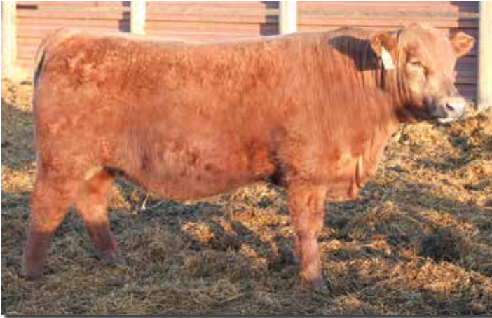
Lot 19 • MK CRK FOREMAN 5271