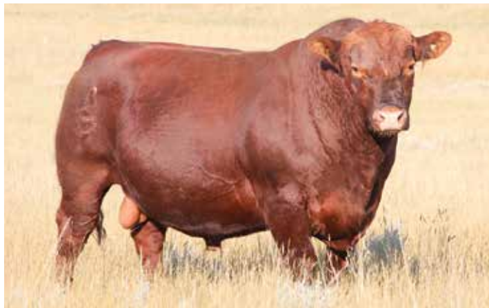
RIDGE SUMO 2104