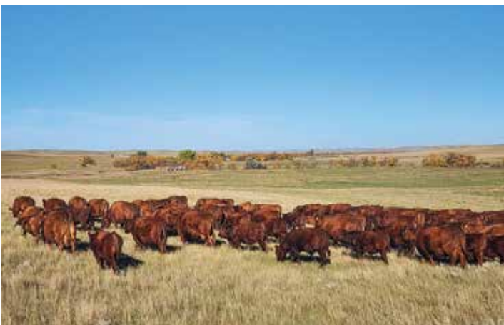
Bull calf pairs headed home.

Combining Lakota 669 and the Princene 338A together provide the genetics to produce exceptional females. Lot 50's dam and paternal granddam also combine together to produce progeny that ratio above average in performance as well as carcass.