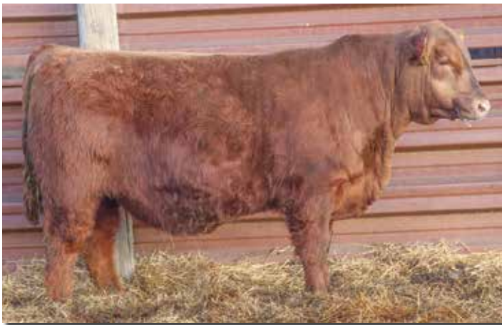
Lot 86 • MLK CRK MONEY TALKS 5343