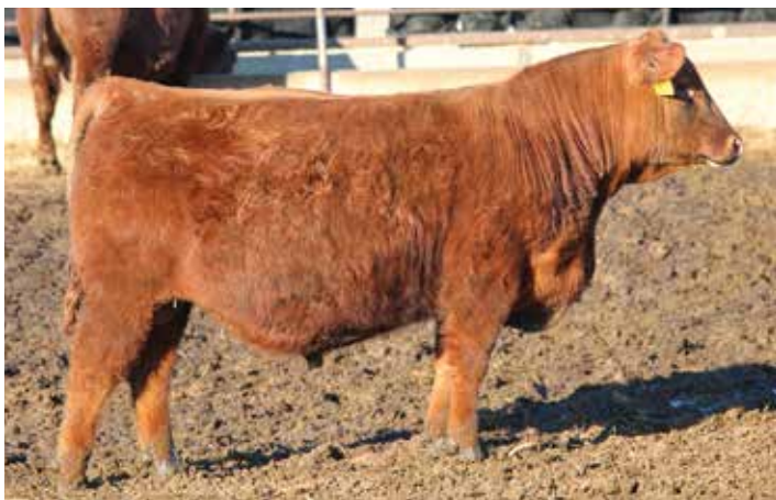
Lot 43 • MLK CRK SUMO 5344

Lot 42 ranks toward the top of the breed for both CED and BW EPDs. Combining two sires that we have used successfully on heifers help to build confidence in this heifer bull prospect.