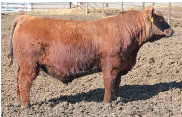
Lot 58 • MLK CRK LIFE IS GOOD 5212