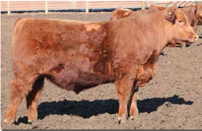
Lot 23 • MLK CRK TOONIE TALK 5284

We are starting Pen 3 with a late March Senn Money Talks son that has ratioed well at weaning and yearling. He has good depth and thickness with a dark red hair coat.