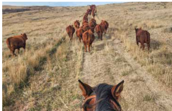
Trailing heifer calves.

Lot 11 is our only Admiral son in the offering this year. He combines two sires that we have used extensively, and the result is a balanced individual that hits many of the marks with individual performance while ranking near the top within the breed on the indices. He is a bull that can work either on heifers or cows while producing daughters that will stay in the herd and be profitable.