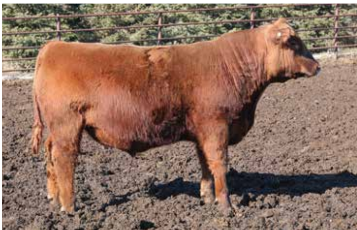
Lot 27 • MLK CRK TOONIE TALK 5309