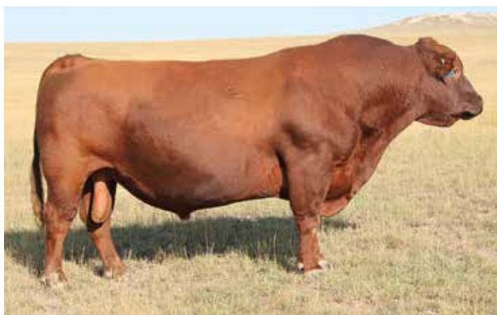
RED U2 MONEY TALKS 530F

been pleased with the calving ease, but the nugget in these genetics are going to be the females that he produces. He has numbers that are very attractive to the industry, minus his growth EPDs. His growth numbers; however, will allow his daughters to thrive on less inputs which equates to a better profit margin for the cow/calf producer. Owned with Leland Red Angus.