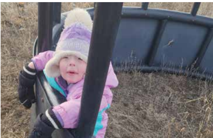
Best corral you can find for Ember!

Lot 20 posted the highest ribeye and 3rd highest marbling score in his contemporary group. He fits well in this pen starting life at 70 pounds and ratioing a 107 at weaning and yearling. His dam is a daughter of Lot 19's dam.