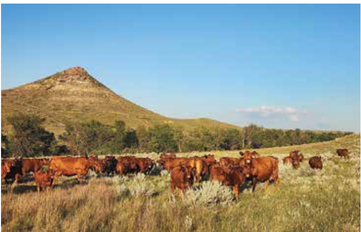
Cows in the hills.

Lot 17 offers a different pedigree combination with Julian 22A and True North but also offers a moderate frame with length and thickness in a calving ease package.