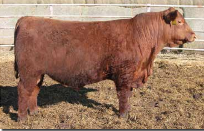
Lot 65 • MLK CRK SPOKESMAN 5204