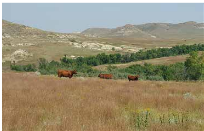
In the hills.

Apollo brings some calving ease to this balanced, mid-March bull. His dam descends back to our Bonnebell 316 donor cow that sold to Senn Red Angus in South Dakota.