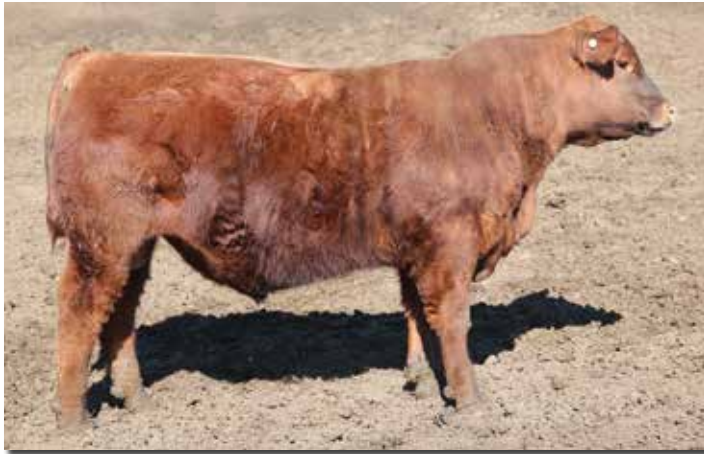
Lot 91 • MLK CRK MONEY TALKS 5360