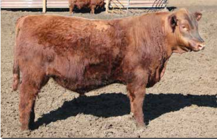
Lot 22 • MLK CRK TOONIE TALK 5351