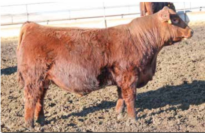
Lot 6 • MLK CRK REDSTONE 5298

5247 is our largest framed, highest weaning, and 3rd top yearling bull in the offering. His dam is a very moderate framed Money Talks daughter that produced the Fusion 2220 reference sire that we are using AI. He will add performance to his progeny.