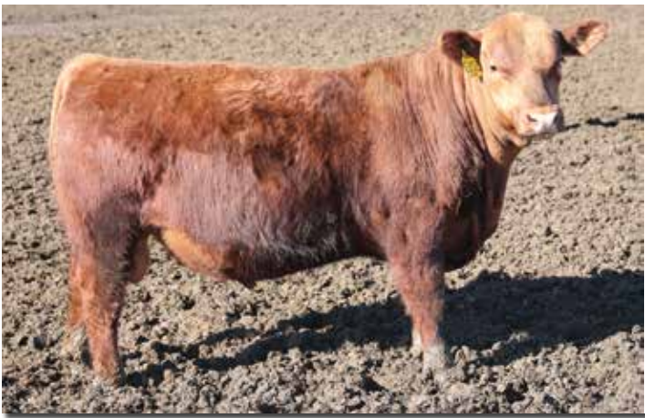
Lot 17 • MLK CRK JULIAN 5263

9132, a 7-year-old Admiral daughter and the dam to Lot 16 has had 5 calves @ 93 birth weight ratio. Her 74-pound Foreman son should work very well on heifers while adding length to his progeny.