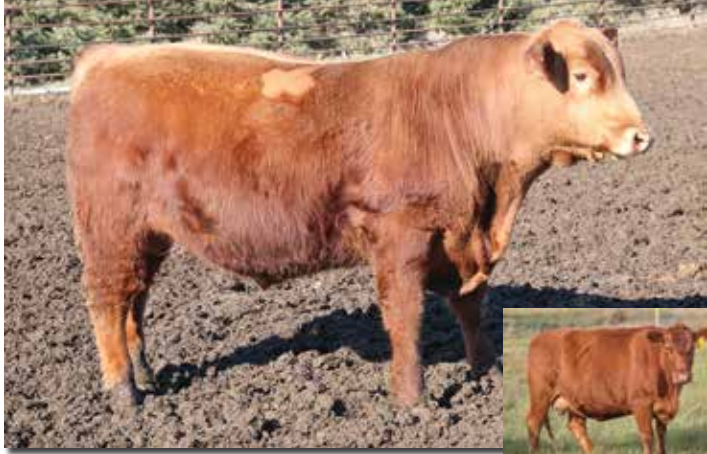
Lot 10 • MLK CRK TERRITORY 5308