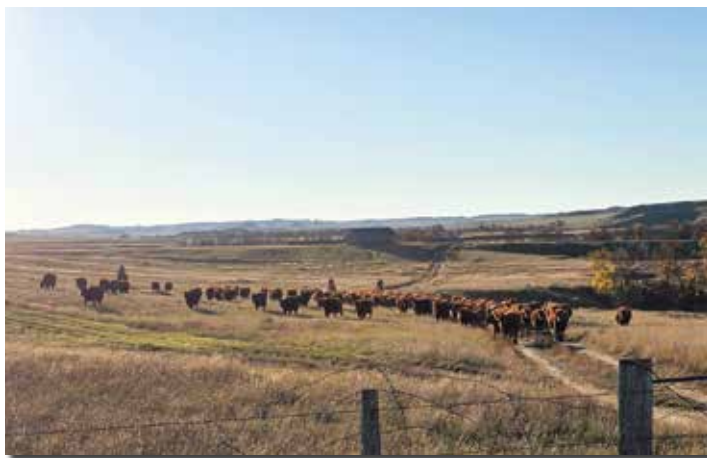
Moving heifer calf mommas after fenceline weaning the calves.

We are starting our 6th pen of bulls with a Ridge McCann son that began with a 63-pound birth weight and weaned off 5 percent ahead of his classmates.