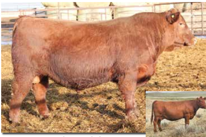
Lot 2 • MLK CRK FUSION 5237

Selecting the bull that starts the sale can be a challenging task. The bull needs to be balanced across the gamut of phenotype, performance, carcass and pedigree. Lot 1 was a calf that caught your eye throughout the summer and still does now. His pedigree is stacked with cows