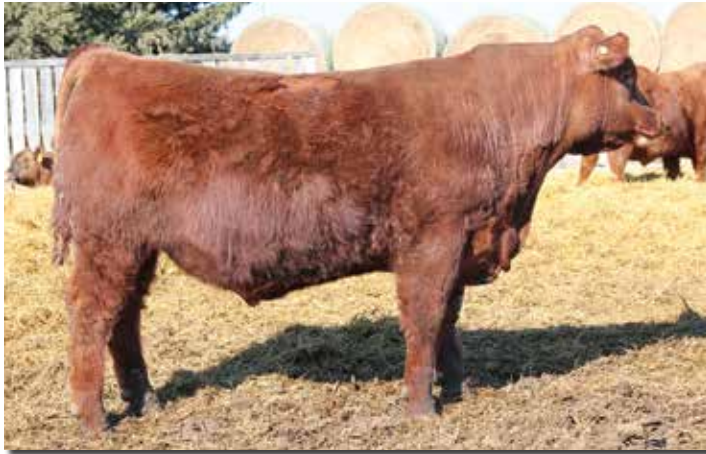
Lot 69 • MLK CRK SPOKESMAN 5213