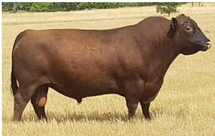
RIDGE ADMIRAL 3411

oldest females are now 11 years old and bringing in good calves while functioning very well in our environment. You will see some of his daughters bringing bulls to this offering. While this bull does well on all the indices, when you study the numbers, his growth EPDs that are not what some people would say are ideal, yet it is where we like them to be for the female to fit our eastern Montana environment. Owned with Sandbur Ridge Red Angus.