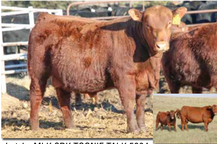
Lot 1 • MLK CRK TOONIE TALK 5294