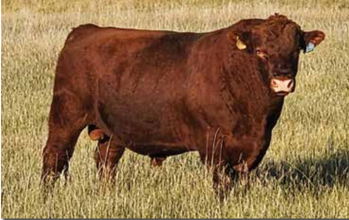
MLK CRK ADVOCATE 0401