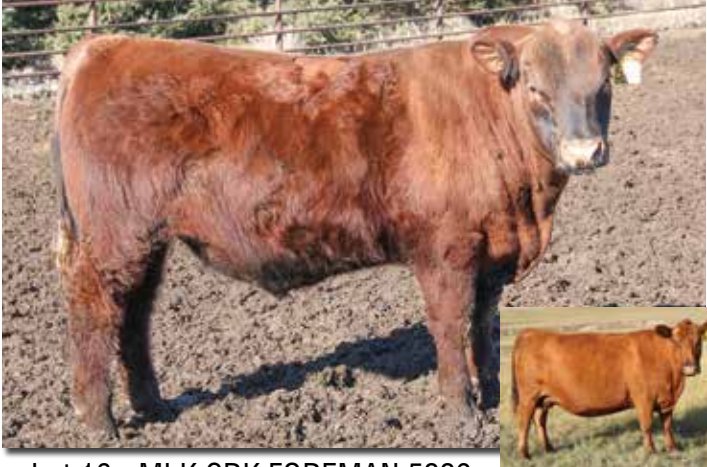
Lot 16 • MLK CRK FOREMAN 5229