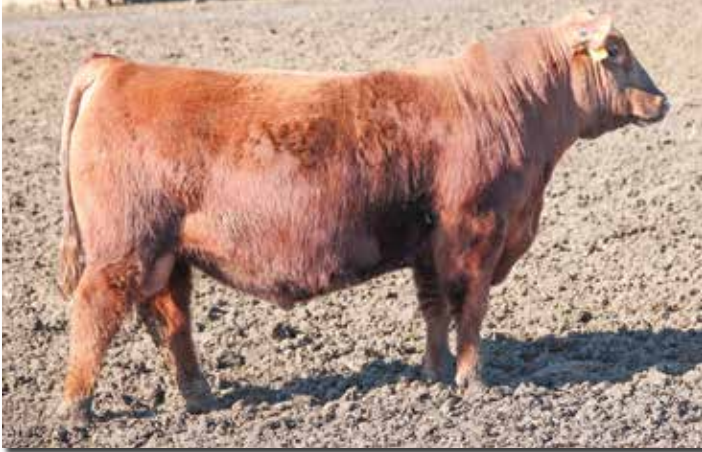
Lot 62 • MLK CRK LIFE IS GOOD 5264