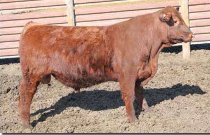
Lot 36 • MLK CRK JULIAN 5311