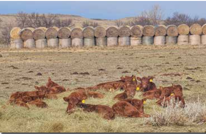
The gang is all here!

007, the Real Deal dam to Lot 65, has consistently produced low birth weight progeny earning a 96-birth weight ratio. Her Advocate 0401 son weaned off 6% better than his contemporaries and scored in the top 8 on marbling.