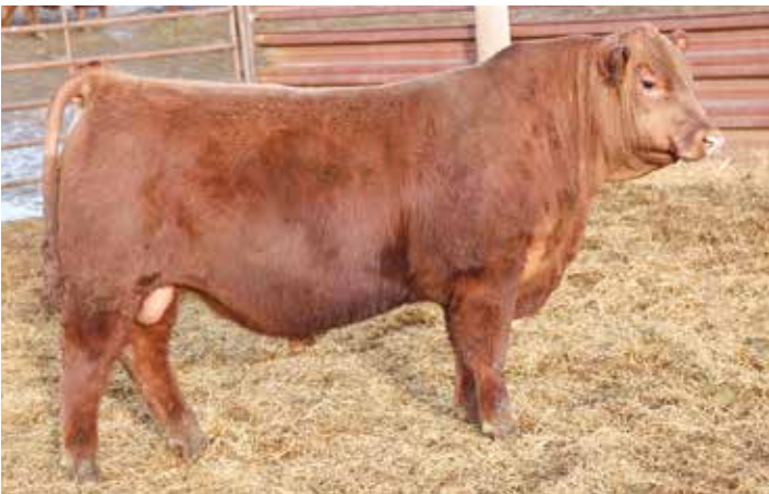
Lot 39 • MLK CRK ALLOY 5233

This low-birth-weight bull ratioed above average for both weaning and yearling weights while being in the top 12% of the breed for Marbling and having an ADG of 3.21. He is in the top 18% of the breed for the ProS index and the top 14% of the breed for the GM index. He could easily be used on heifers to produce calves that come easy but grow and do well in a feedlot.