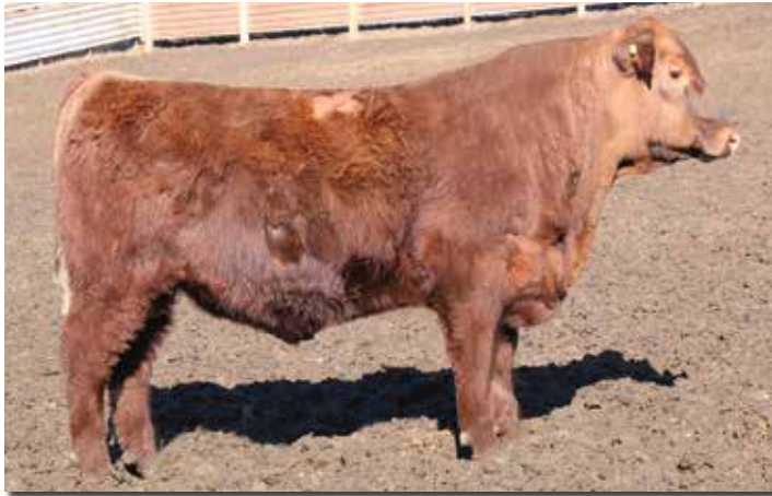
Lot 13 • MLK CRK JULIAN 5268