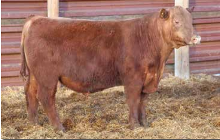
Lot 52 • MLK CRK FIVE STAR 5221