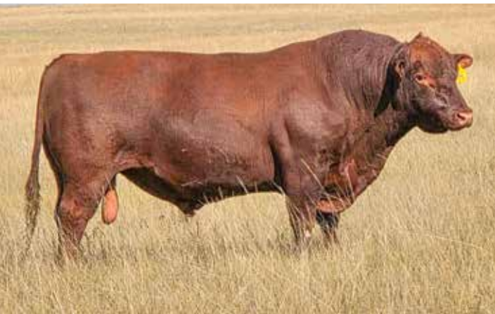
SENN MONEY TALKS 129