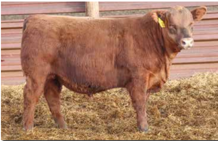
Lot 34 • MLK CRK ALLOY 5257

Lot 33 was raised by a foster dam because his mom developed pneumonia prior to calving and wasn't going to make the summer. He is a younger calf that would have ratioed very well and is long and thick made.