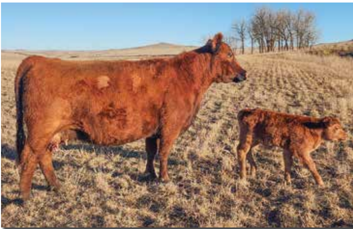
Dam to Lot 82 • MLK CRK LAKOTA 896