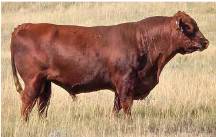
MUSHRUSH APOLLO J836