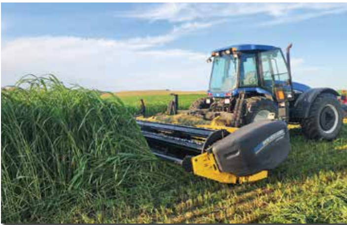
While the boys play, the girls will hay!