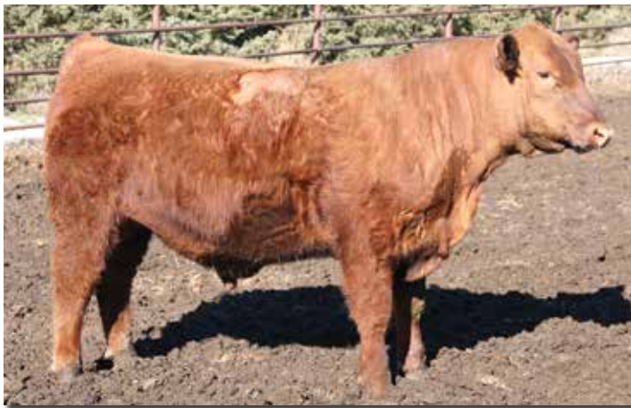
Lot 14 • MLK CRK FUSION 5266

5268 was the standout bull calf in the first-calf heifer pasture and measured it on the scale, bringing in the highest weaning weight in his contemporary group. He combines the calving ease trait of the Julian 22A line with Fusion 5202 which will bring calving ease but won't sacrifice the growth or the maternal.