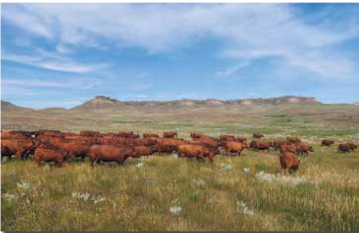
Commercial cows headed to the hills.

5234 is a bull that is a prime candidate for heifers on account of his birth weight and EPD profile. When you study him phenotypically, he has the length, depth and thickness to look good in a herd of cows.