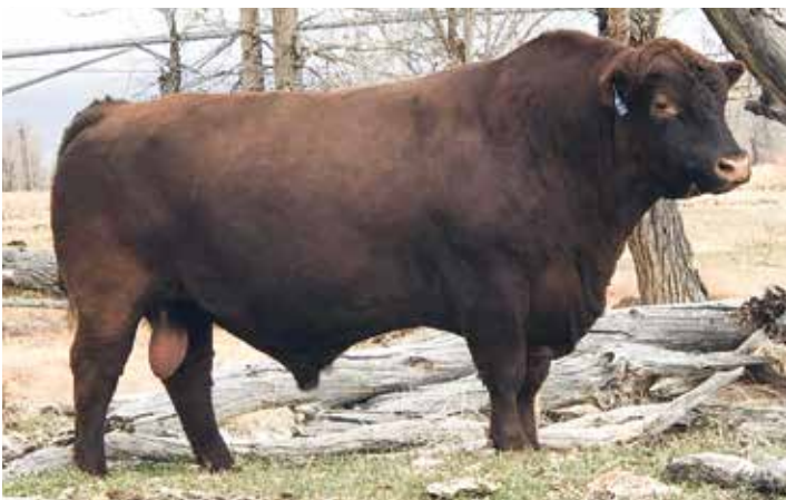
5L FOREMAN 2174-370E