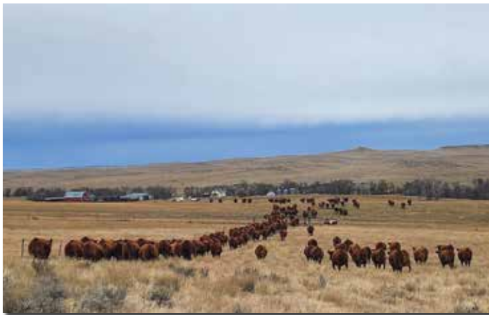
Bred heifers headed back to headquarters.

Lot 25 has developed a nice ratio profile across all weight and carcass measurements. His dam is a dark red Foreman daughter that breeds on time and brings in above average calves.