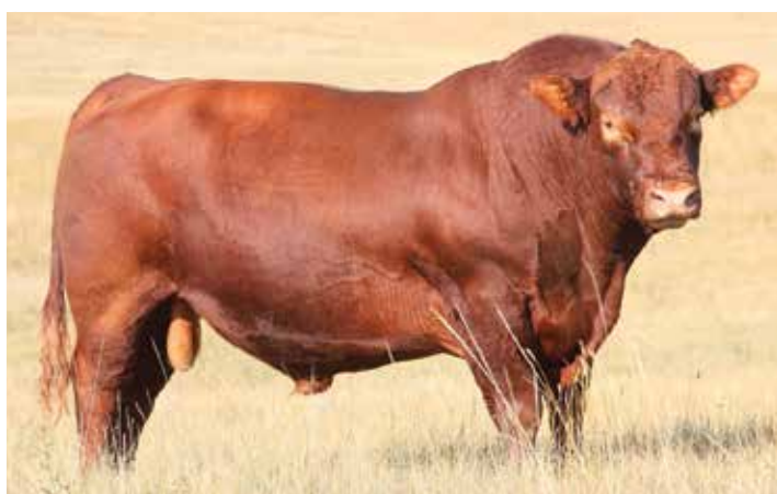
MLK CRK REDSTONE 2412

Copenhagen 2223 is a bull that we kept back out of the Princene 338A cow we had purchased from the Crowfoot dispersal. His progeny have an attractive look to them with good performance and the females should be as good as it gets.