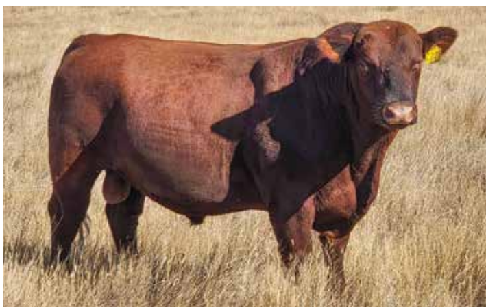
MLK CRK COPENHAGEN 2223

Sumo 2104 is a moderate framed 5L Bodybuilder son that we picked out of the Flatwater Gang sale in 2023. His progeny are moderate, easy fleshing and have good performance. His first daughters are calving this spring and full of capacity with that easy keeping look. We will be using this sire more as we collected him this past fall to be able to use him A.I. as well as natural.