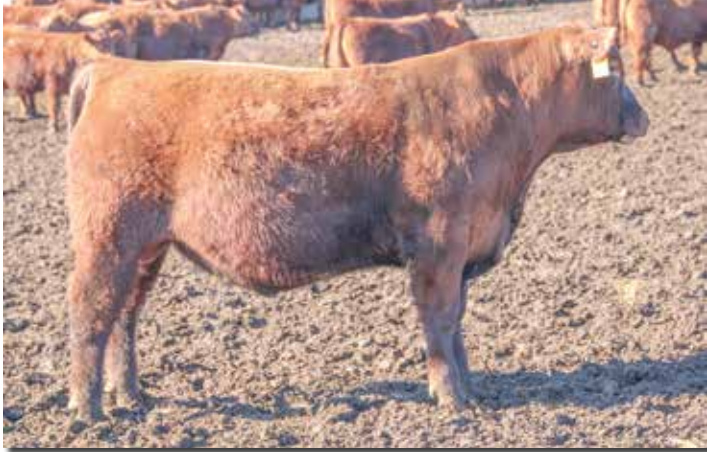
Lot 77 • MLK CRK FOREMAN 5277