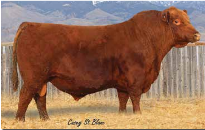
5L LIFE IS GOOD 1201-52H