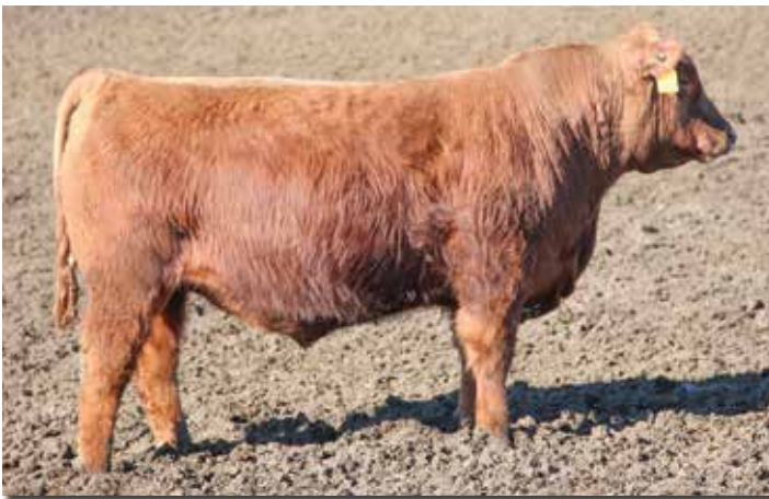
Lot 20 • MLK CRK LIFE IS GOOD 5275

Lot 19's dam is currently in our donor program after producing 7 calves with a 92-birth ratio and a 105-weaning ratio. Her daughter last year was selected for the NILE and sold to L Lazy T Cattle Company at Harlem, MT. This Foreman son should be a great heifer bull but will produce progeny with good growth as well as great females.