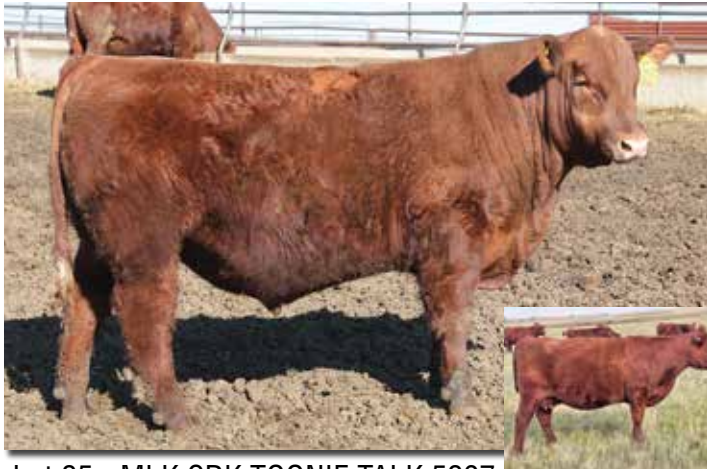
Lot 25 • MLK CRK TOONIE TALK 5297