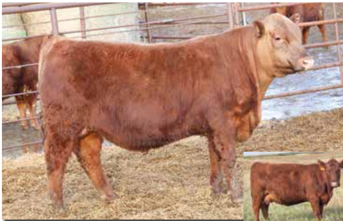
Lot 11 • MLK CRK ADMIRAL 5217

1123, the dam to Lot 10, is a 5-year-old Provision daughter that is showing that she can earn her keep by producing calves that continue to exceed the average and look the type. 5308 offers a different pedigree on the top side yet fits right in the group phenotypically.