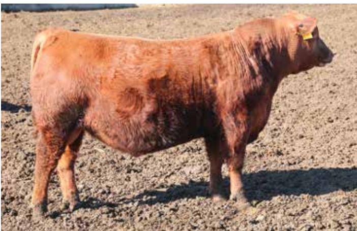
Lot 64 • MLK CRK SPOKESMAN 5505