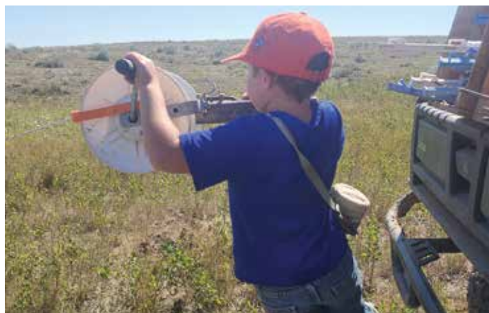
Blaze helping roll up electric wire.

5370 brings a balance of moderate birth weight with above average growth at both weaning and yearling.