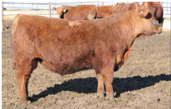
Lot 90 • MLK CRK MONEY TALKS 5374

Lot 90 is a long made, attractive Money Talks son that has a moderate birth weight with above average growth.