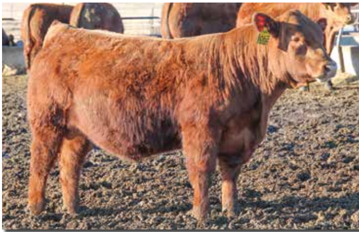
Lot 42 • MLK CRK JULIAN 5301