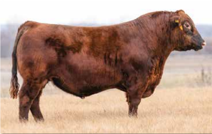
MLK CRK FIVE STAR 2232