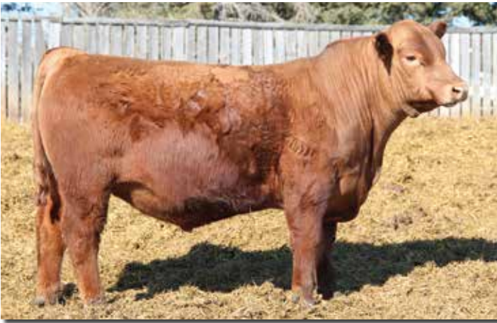
Lot 60 • MLK CRK LIFE IS GOOD 5234