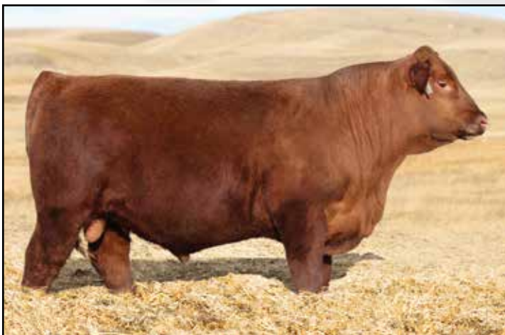
LOT 9 - VGW MAIN STREET 590