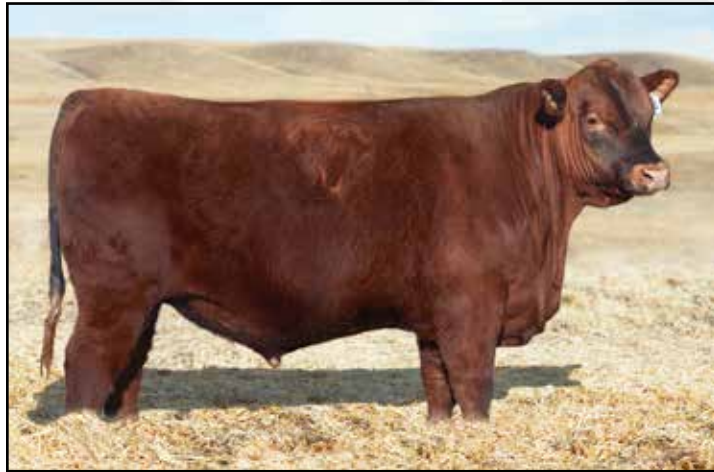
LOT 22 - VGW REAL ESTATE 557