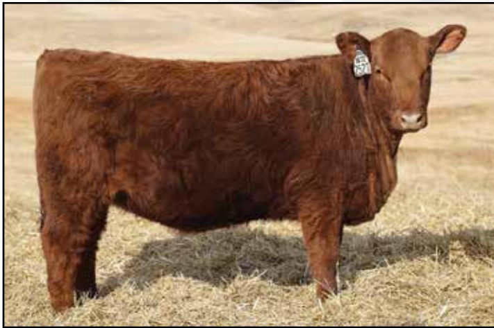
LOT 112 - VGW DEEP-FIREFLY 2527