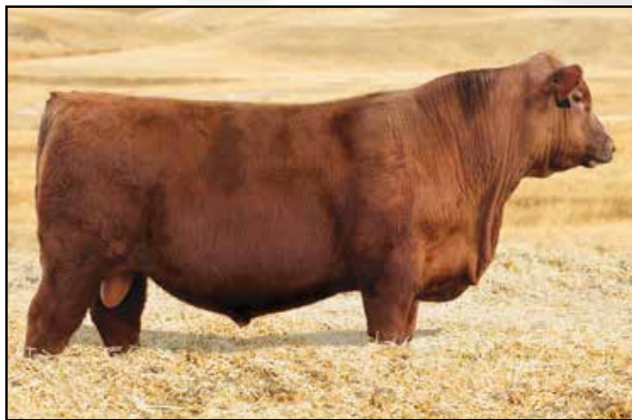
LOT 23 - JKW ROSCOE 501