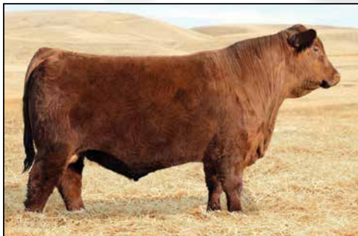
LOT 64 - VGW DEEP TREAD 538