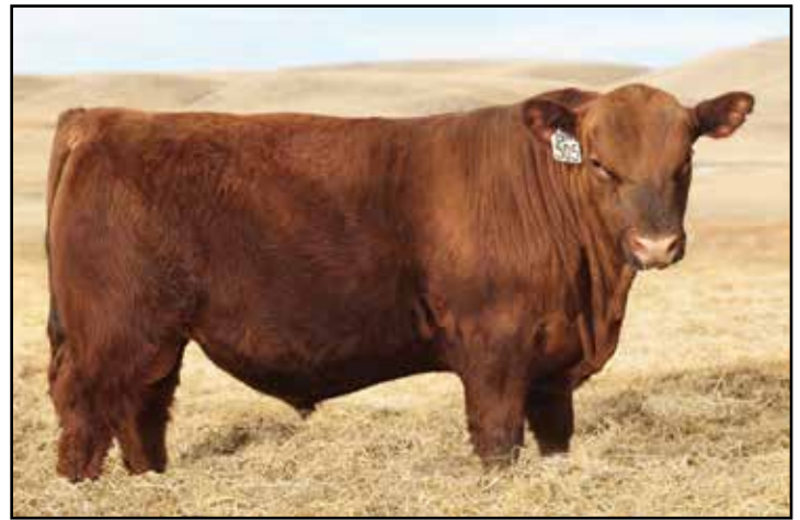
LOT 83 - VGW WIZARD 505