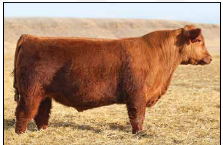
LOT 19 - VGW DECLARE 503P