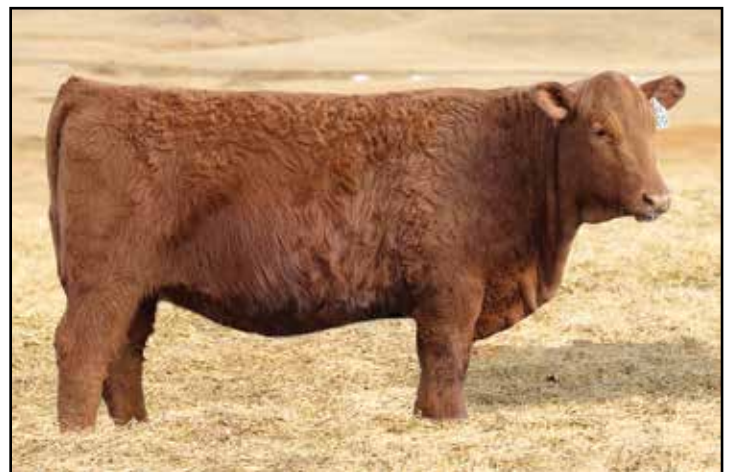
LOT 87 - VGW DEC-STAR 2509