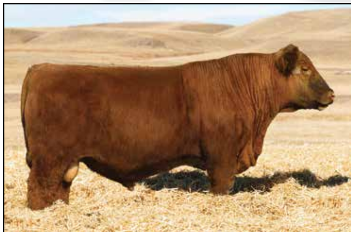
LOT 54 - VGW LOOKOUT 521