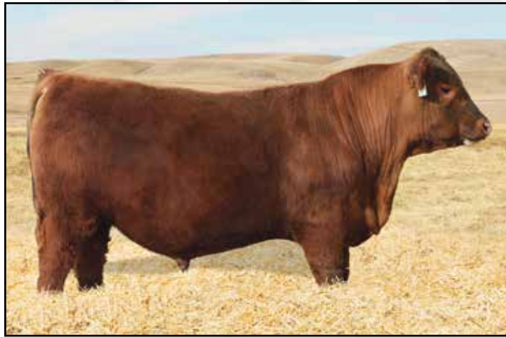
LOT 31 - VGW PROFICIENT 545