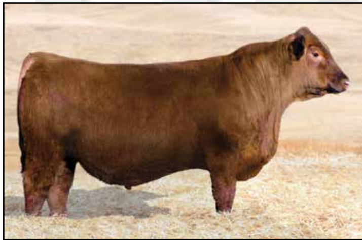
LOT 69 - VGW DAY BREAK 537