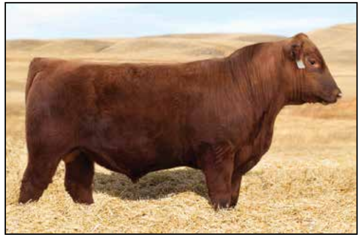
LOT 16 - VGW DEMAND 516