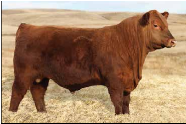
LOT 7 - VGW BOTTOM LINE 510