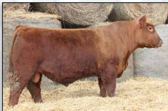
ELSL KRYPTONITE 768K - SIRE OF LOTS 8 & 10