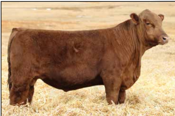
LOT 15 - VGW DOWNLOAD 514