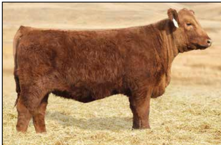
LOT 92 - VGW REG-STAR 2599