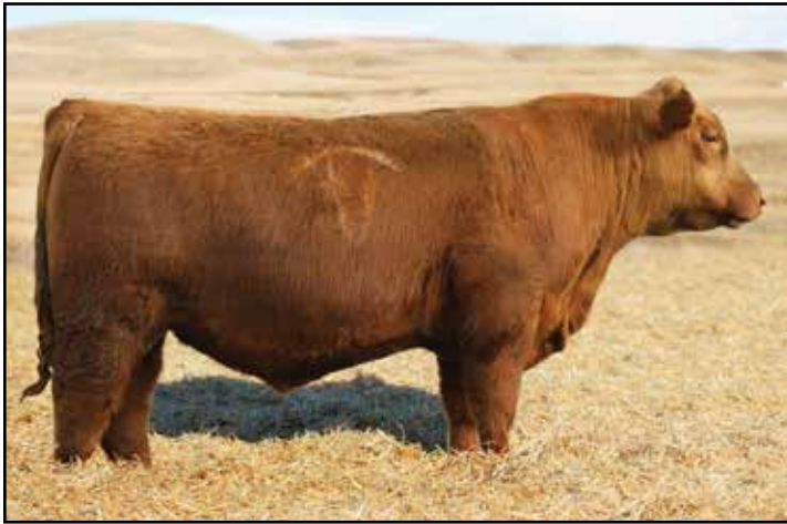
LOT 61 - VGW LOUISVILLE 506P