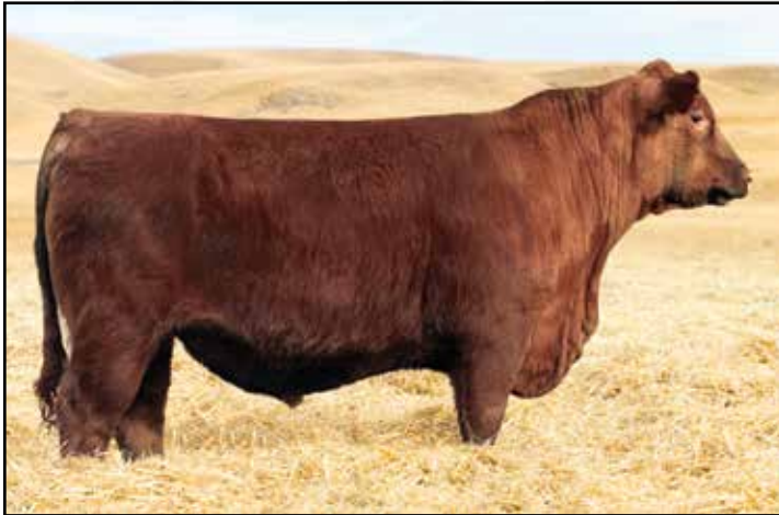
LOT 8 - VGW KRYPTONITE 508P