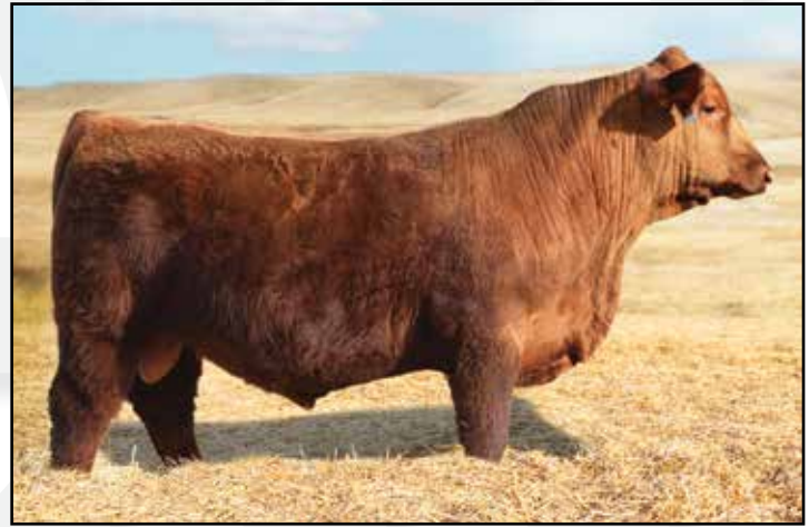
LOT 75 - VGW WANTED 535