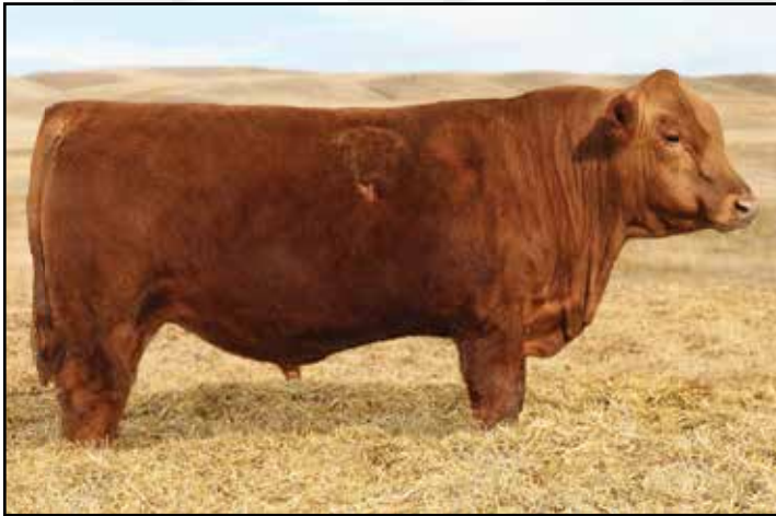
LOT 14 - VGW DELUXE 511