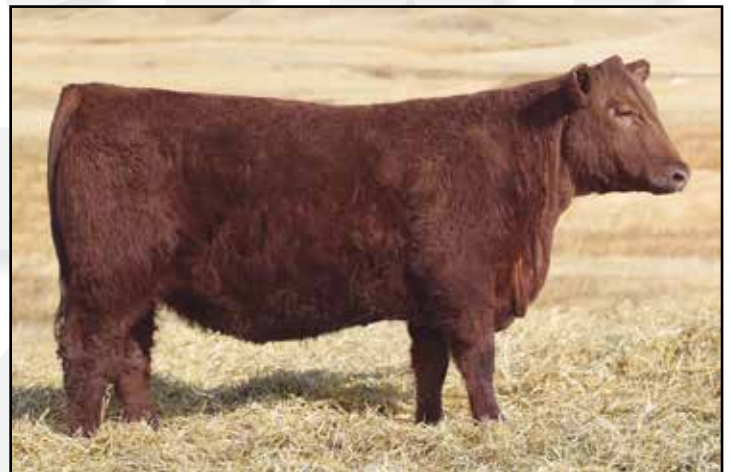
LOT 86 - VGW WIZ-DORA 2505