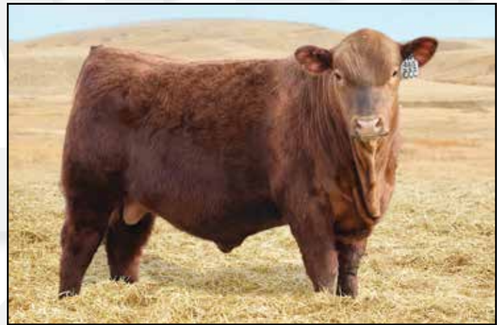
LOT 66 - VGW DREAMS ON 555