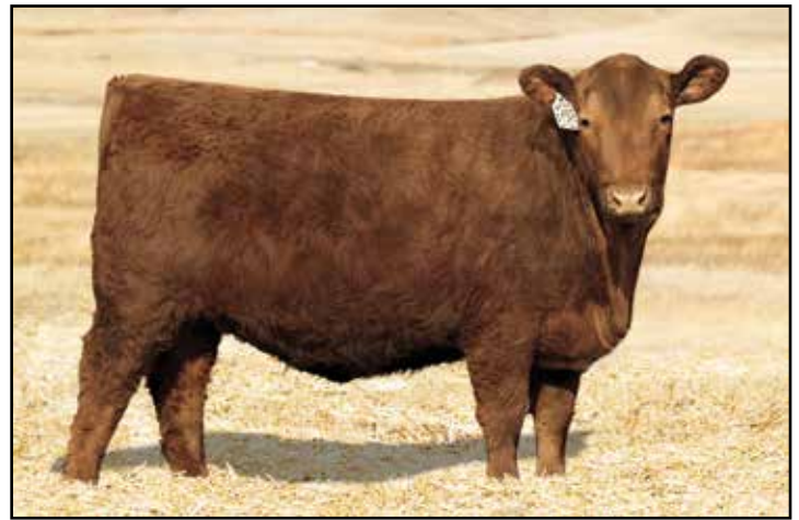
LOT 115 - VGW WIZ-FIREFLY 2573