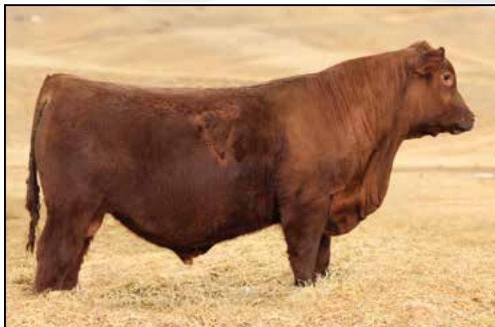
LOT 82 - VGW WIZARD 563