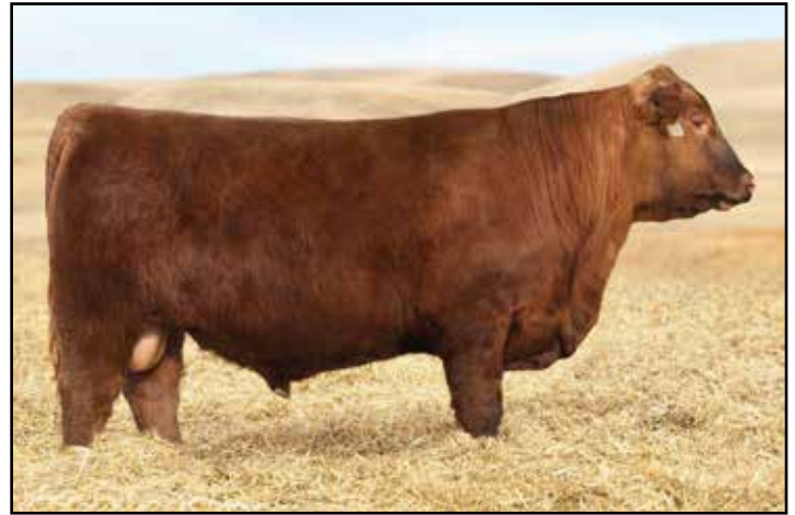
LOT 24 - VGW REGIMENT 571