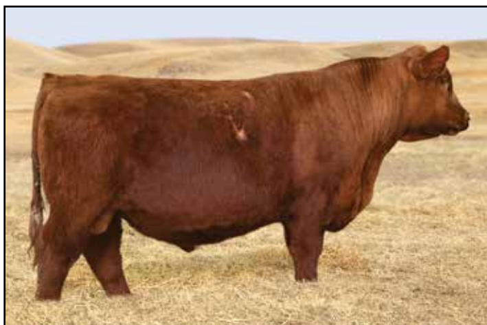
LOT 10 - VGW ROCK HARD 550