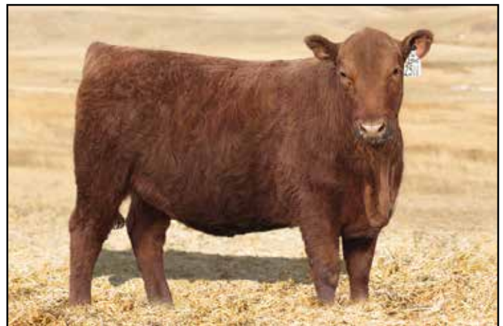
LOT 109 - VGW WIZ-FLOMARIE 2511