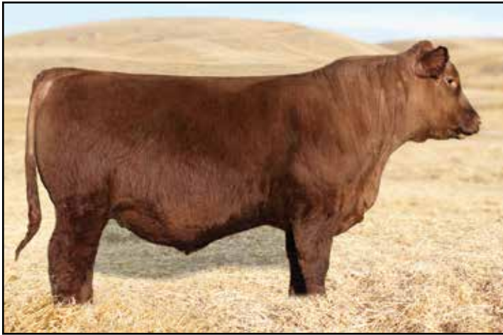
LOT 13 - VGW DATELINE 506