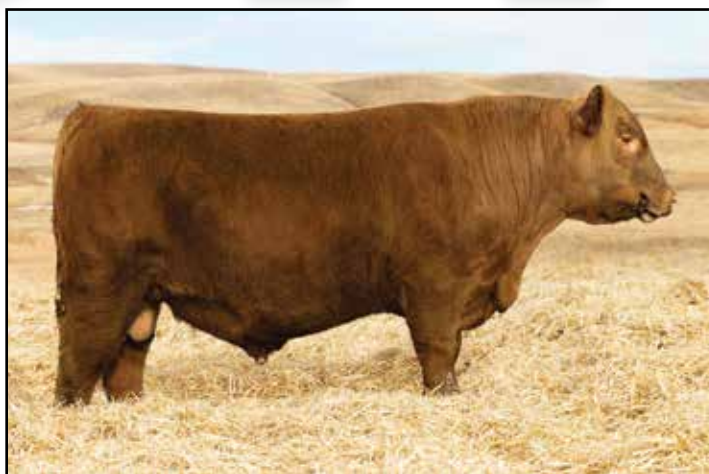
LOT 12 - VGW SLUGGER 559