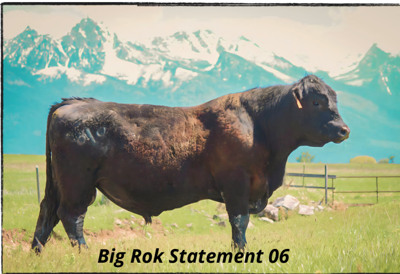
Big Rok Statement 06