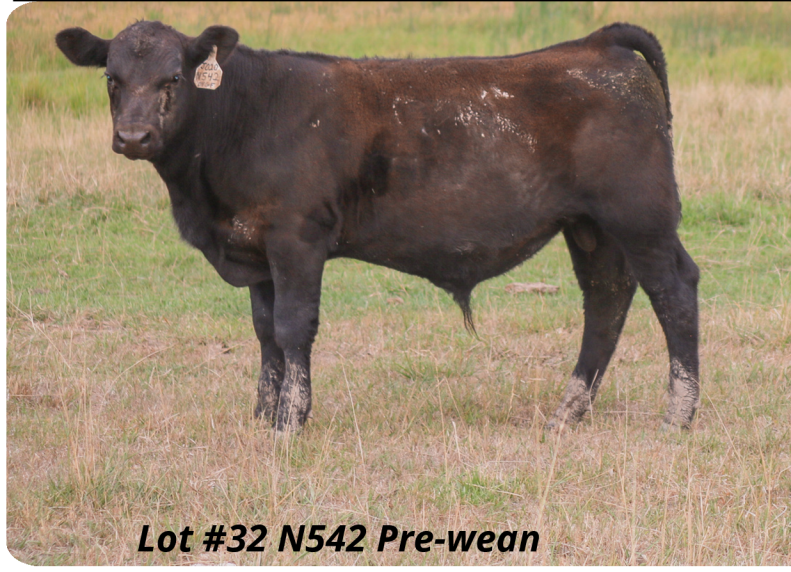
Lot #32 N542 Pre-wean