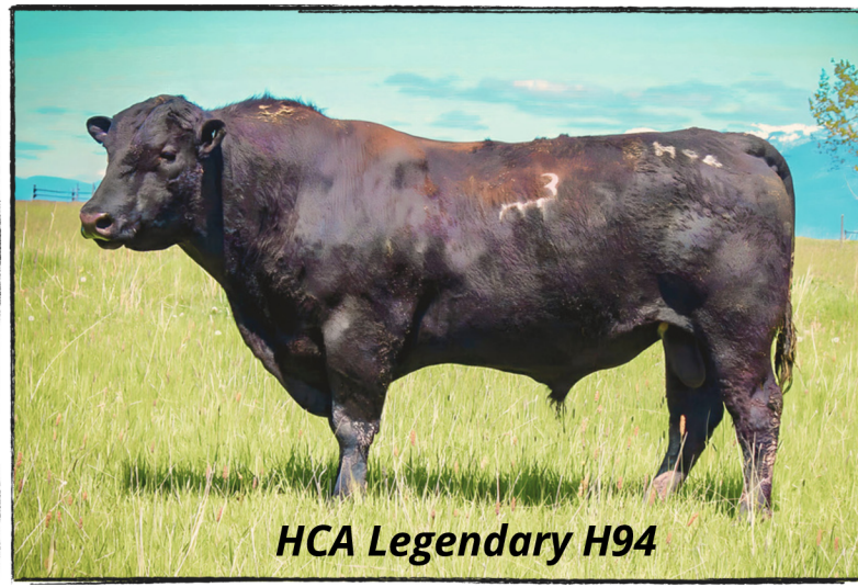
HCA Legendary H94