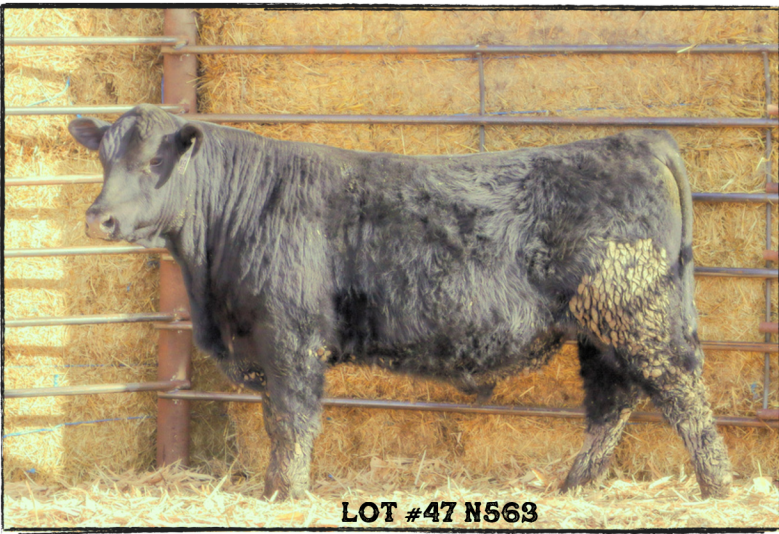
LOT #47 N563