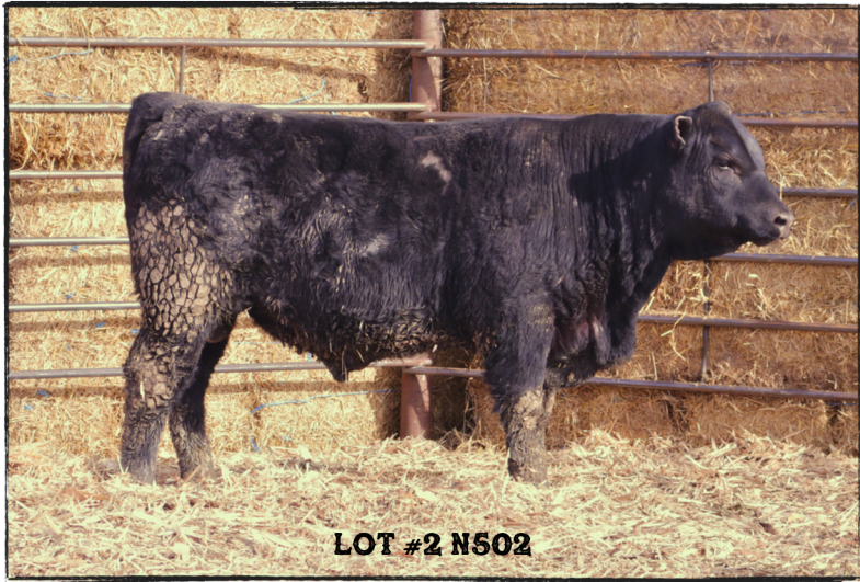
LOT #2 N502

1 Blevins Unique Brigade N501 DOB: 2/7/25 Tattoo: N501 Reg. No. 21480532 Tag: N501 Baldrige Colonel C251 Sire: Deer Valley Brigade 81247 Deer Valley Rita 36142 Deer Valley Unique 5635 Dam: BLEVINS Queen Unique L149 Blevins Queen Rain 9264