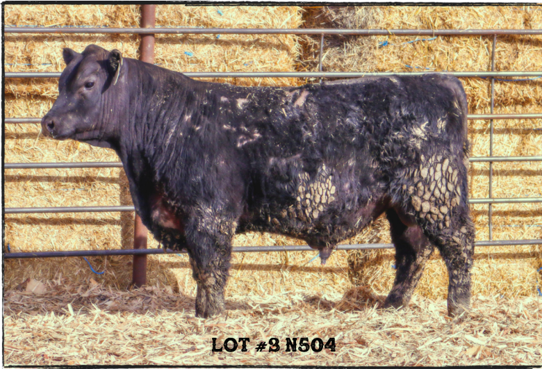
LOT #3 N504