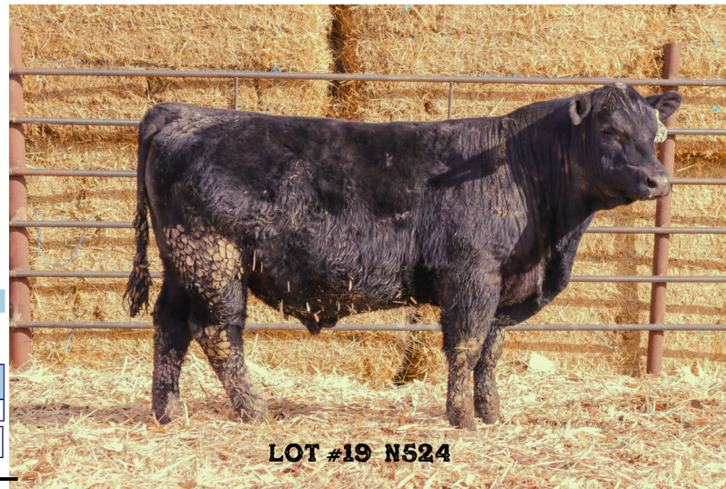
LOT #19 N524

Heifer Bull. Dams production W 8 @ 99 Y 6 @ 102.