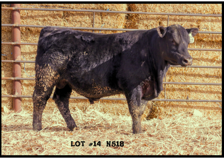
LOT #14 N518

MARB I + 0.84 RE I + 0.91 FAT I -0.001 CLAW ANGLE Dams production W 1 @ 95.