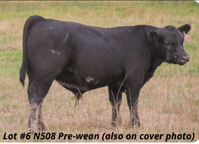
Lot #6 N508 Pre-wean (also on cover photo)